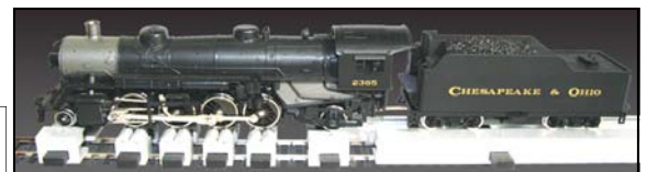
Bachrus Test Stand, for both diesels and steam engines. Adjustable for both HO and S. $91.00

Right-- Animated Signs from Miller . [See them "in action" on our website!]