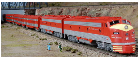
TEXAS SPECIAL E-8 set, from Am. Models