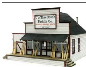
"Up The Creek Paddle Shop" (Right), $75.

Carling Black Label Wood Reefer Two new numbers; $52.95 + shipping