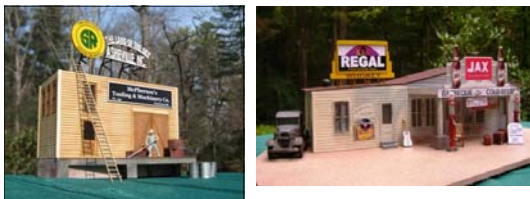
McPherson's (L), $49; Frenchie's (R), $55